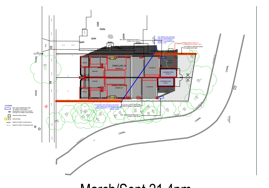
March/Sept 21 4pm